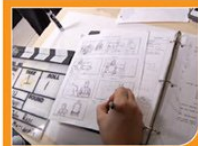
Organization and Naming Your Shots