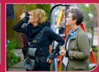
Be a Female Filmmaker By Rachel Feldman