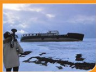
Chasing the Muse